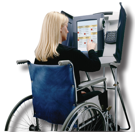
Premier AccuVote TSX Touch Screen Voting System